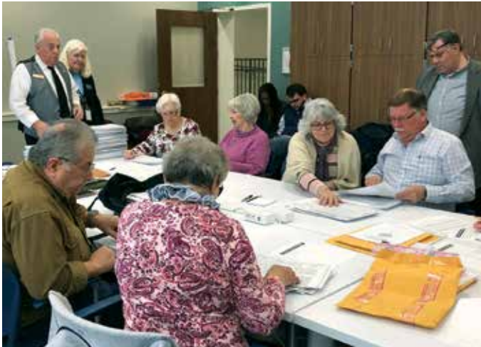
State Senate race recount.

November 6, 2018 was our first General Election with 4,702 voters casting their ballots at our new Municipal Office Complex. In spite of the heavy turnout (71% of registered voters) and rainy weather conditions which made it less than ideal, voting took place with little disruption.