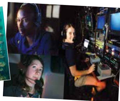
Above right, each Nautilus expedition includes scientists, student interns, and educators.

Just back from the last leg of a 7 month-long expedition by his Corps of Exploration, Dr. Robert Ballard was at his Lyme, CT home - busy summarizing the 2018 series of expeditions by his 64-meter exploration vessel, the E/V Nautilus. Yes, he discovered the Titanic in 1985 (old news, he says, of what was actually a cover for a top secret naval operation). Yes, his work caused a wholesale change in how science was taught by uncovering the secrets of plate tectonics and hydro thermal vents (a revolutionary revelation evidencing that sunlight wasn't needed to support life). And the 30-year naval veteran and /geologist/undersea robotics developer/explorer has for so many years revealed to the world human history lost beneath the sea - with over 35 National Geographic television specials and countless books. After 150+ expeditions, starting at age 17, retirement isn't in the works for the 76-year old.