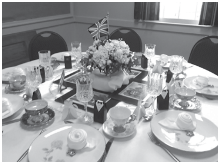
A beautiful table setting at the Royal Wedding English Tea Party in 2018.

go online to find out the various registration fees. T-shirts will be handed out to the first 200 who register. The race is USATF certified with chip timing, mile splits, scenic routes, water stops and food for runners. Volunteers and police will be along both routes to support the runners and direct traffic. Student discounts are available. Check out the flyer at: http://www.e-clubhouse.org/sites/easthaddamc/page-10.php . Register online at: https://racewire.com/register.php?id=9803 . For more information email: ehclrace@yahoo.com . SEE YOU AT THE RACES!